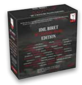
Idil Biret - 20<sup>th</sup> Century Piano Edition 8.501504 • 15 CDs