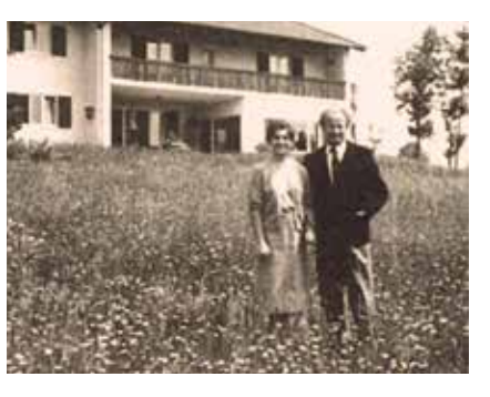
Idil Biret with Wilhelm Kempff in Ammerland, Germany 1958