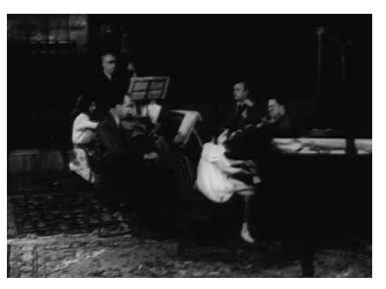
Idil Biret, at age seven, playing the D minor Piano Concerto of Bach at the Ankara Radio Hall in 1948

cludes a passing imitation of the subject itself, which appears in stretto. A second subject is introduced by the bass in accompaniment to the second entry of the subject, and is thereafter used as an accompaniment to the subject. The B minor Fugue brings to an end a remarkable work that set. for all time, an example of contrapuntal keyboard writing, in all its possible variety, in which technical devices are deployed with absolute mastery.